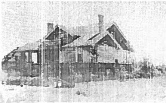
c1912.